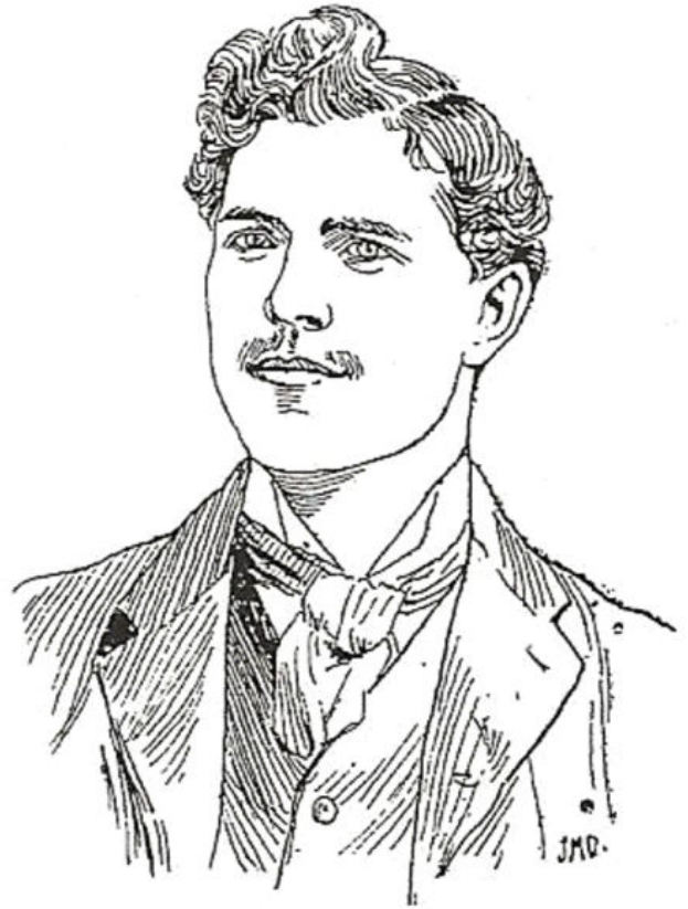
(Left) Ramsay MacDonald in 1892; (Right) Represented in a drawing in the Dover Express.

Indeed it does. For it shows that his anti-militarism and his enthusiasm for disarmament which was expressed with passion and energy in his Unitarian preaching as early as 1893 was a robust and enduring aspect of his Christian faith, and an infinitely stronger impetus for his politics than has ever been suspected. Remember that MacDonald vigorously opposed the Boer war and was notorious in his continuous opposition to and criticism of World War I. He not only risked career and comfort but regularly placed himself in direct physical danger whenever he braved the anger and the missiles of the mob in his determination to proclaim his opposition.